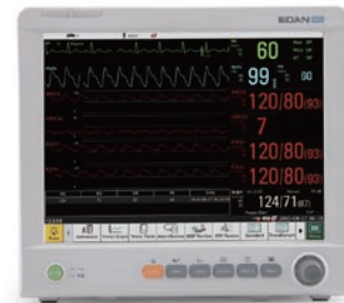
iM80 Patient Monitor